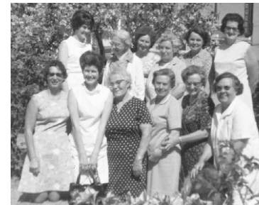
Monday Morning Life Group

The picture on the left was taken at the old church in “Van Staden” Street and on the right the members in 1995.